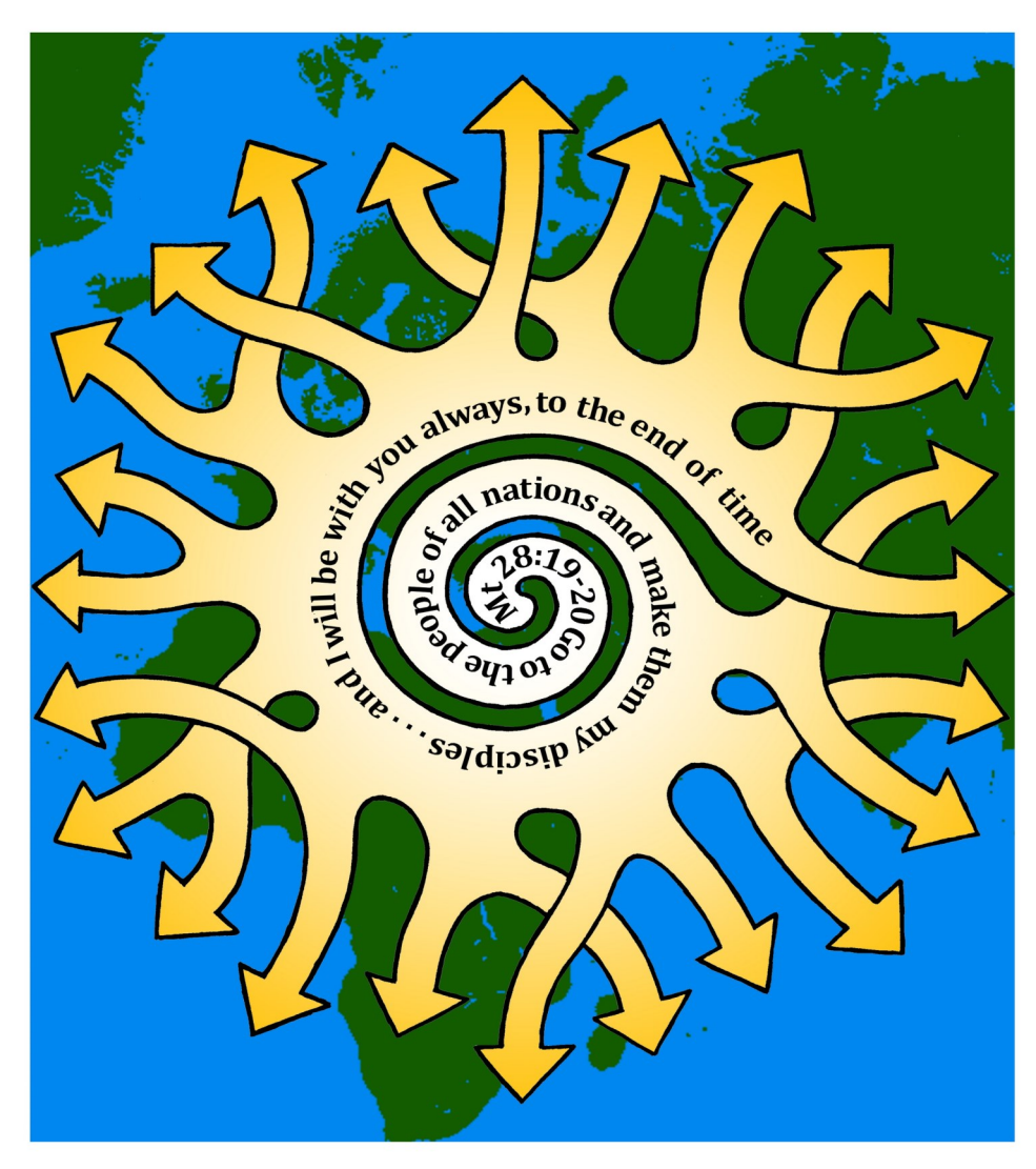
Volume 132 No 4